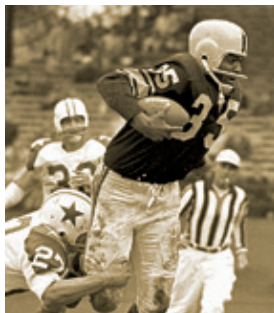
John Henry Johnson

The leader of the "Steel Curtain" defense during the 1970s, Joe Greene dominated the NFL during that decade and helped the Steelers to four Super Bowl victories. The team's No. 1 draft pick in 1969, Greene quickly became a presence in the league as he was named the NFL's Rookie of the Year and received the first of his 10 Pro Bowl invitations. He earned All-NFL honors five times and all-conference 11 straight years to begin his career. Greene was twice the league's Defensive Player of the Year and played a critical role in the Steelers' Super Bowl IX victory over the Minnesota Vikings with a pass interception and a fumble recovery.