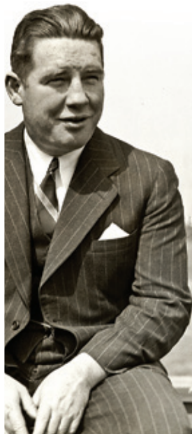
Arthur J. Rooney Sr.

Founder, President, Chairman of the Board (1933-'88) Elected: 1964