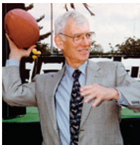
Daniel M. Rooney

Born on January 27, 1901, in Coulterville, Pa., Art Rooney was one of the most influential personalities in the sport of football. Mr. Rooney, who was affectionately referred to as "the Chief", founded the Steelers organization on July 8, 1933, with a $2,500 purchase. Mr. Rooney helped orchestrate the NFL-AFL merger and kept the Steelers franchise afloat during the depression, World War II, many losing seasons and financial problems. Mr. Rooney won his first of four Super Bowl championships in 1974.