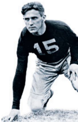
Johnny 'Blood' McNally

Bert Bell was an owner of the Philadelphia Eagles (1933-'40) and co-owner of the Pittsburgh Steelers (1940-'45). Bell was named the NFL commissioner (1946-'59) and helped set up the league's television and anti-gambling policies. He also oversaw the merger of the NFL and All-American Football League in 1949. Bell died on October 11, 1959, while watching a football game between his two former teams: Pittsburgh and Philadelphia.